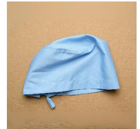
Proposed reusable scrub hats

With an estimated 75 hats used per day within our theatre suite and a turnaround time of up to three days for our laundry facilities, we propose that a 5-day supply would be sufficient for our initial order, with potential for requiring replacements of up to 20% in years 2 and 3.